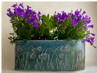
DEEKS Liz ( Hertfordshire )