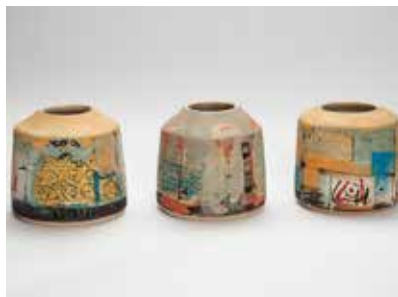
IMAM Zeba ( Stoke on Trent )

adamhughesceramics.com info@adamhughesceramics.com