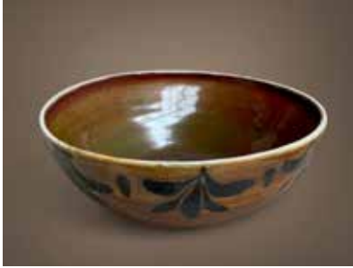
WITHERS Penny ( Sheffield )