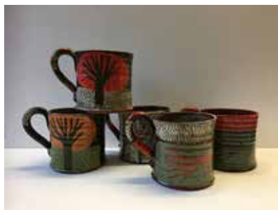
MERRICK Isabel ( Devon )

nickmemberypottery.co.uk nickmemberypottery@gmail.com