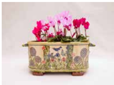
WINFREY Katherine ( Cambridgeshire )

johnwestatlansdown.co.uk info@lansdownpottery.co.uk