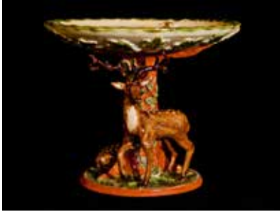
SMITH Ros ( Derbyshire )