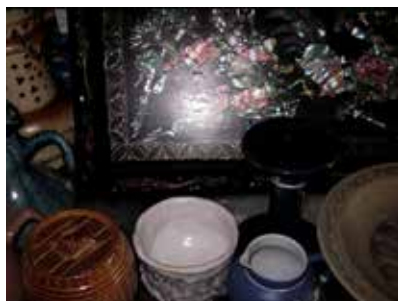
LAW Rob ( Derbyshire )